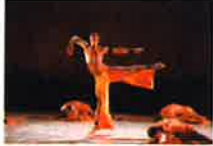
Arts & Culture